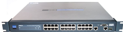
Upgraded Network Infrastructure